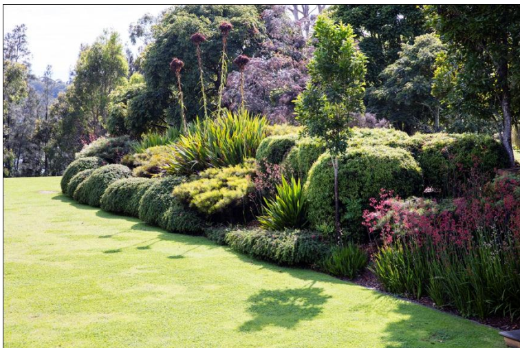
The garden we know so well, full of colourful, well maintained and thriving Australian Plants

To visit the Island is to engage with Christina’s passion, her knowledge and enthusiasm for Australian plants, and to hear her stories about all she has discovered including her mistakes and learning curves, during the long process of creating the garden.