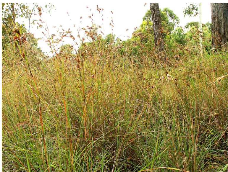
Themeda triandra grassland

Some APS members joined The Friends of Grassland as they headed off to Toragy Headland to inspect the condition of this Themeda Grassland.