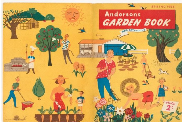
The "Anderson Garden Book and catalogue" 1956